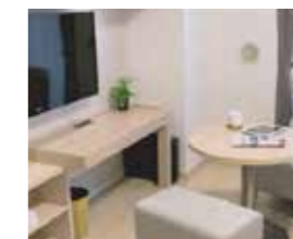
MYSTAYS PREMIER RESIDENCE SHIBA

② Other accommodations on the housing information list on our website: Contact one of them directly and make your own reservation.